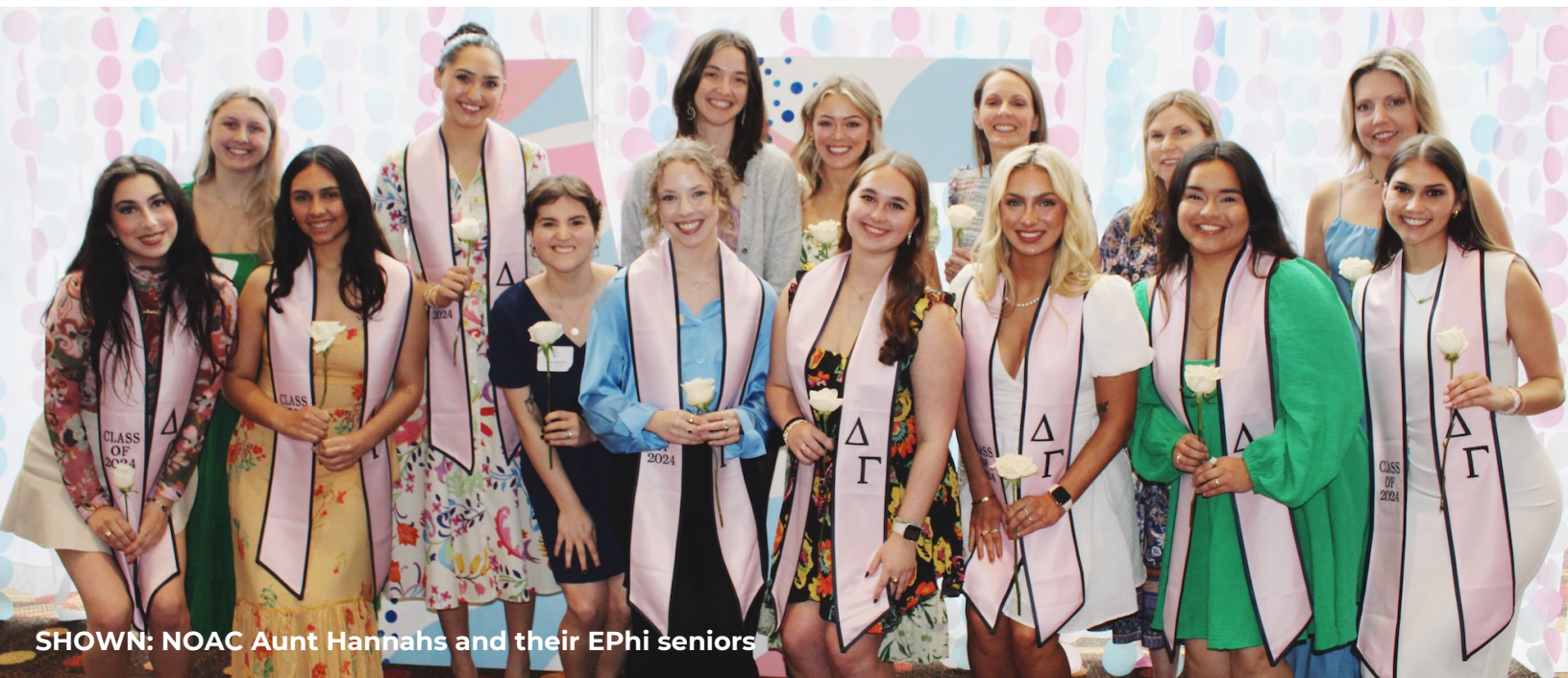
SHOWN: NOAC Aunt Hannahs and their EPhi seniors